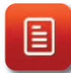
By Laws Online

This application allows financial secretaries to manage financial transactions; create, edit and archive receipts, vouchers, assessments and adjustments; produce billing notices; and manage payments received from members.