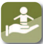
Office Of Youth Protection

A reference tool that contains definitive guidance on a wide range of subjects relating to the governance of subordinate units, including questions and issues about which the Supreme Advocate's Office is frequently consulted for advice.