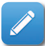
Officers Desk Reference

Here is an overview of the applications within Officers Online that you may see (varies depending upon your officer role):