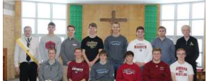
New Brother Knights from Mason City