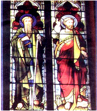
Barnabas and Paul

Paul, Barnabas, and others were sent to Jerusalem to consult the Apostles ... for a decision regarding the need for Gentiles to become Jewish and follow the Mosaic laws, such as circumcision and the dietary laws.