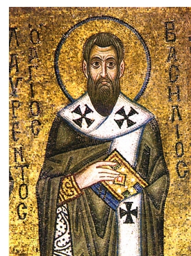
Icon of St. Basil

St. Basil died two years before the Council but his contribution came earlier. He ranks among the greatest figures in church history as a most distinguished Doctor of the Church. He ranks after Athanasius as defender against heresies of the fourth century. He was especially known for his care of the poor and underprivileged.