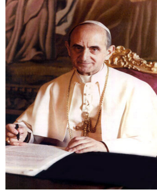
Pope Paul VI

The Council began with the prayer: ‘We are here before you, O Holy Spirit...’